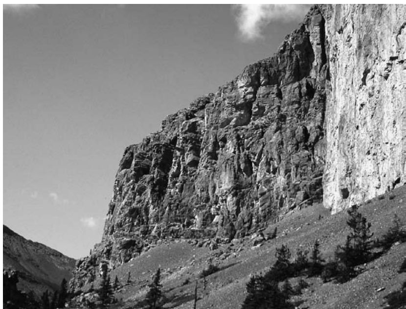
The West Wing of Wakonda Butte.