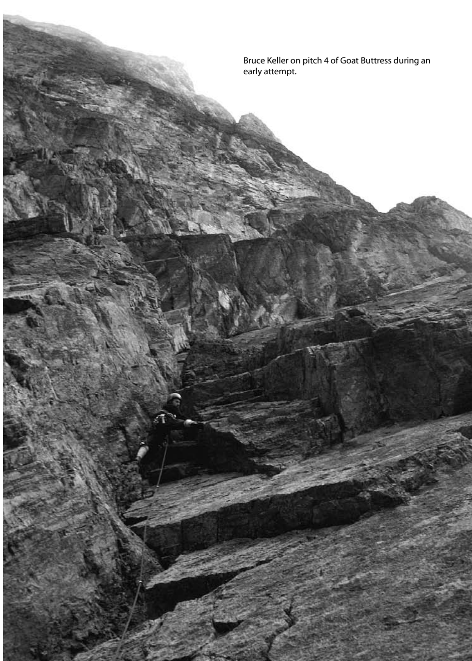
Bruce Keller on pitch 4 of Goat Butte during an early attempt.