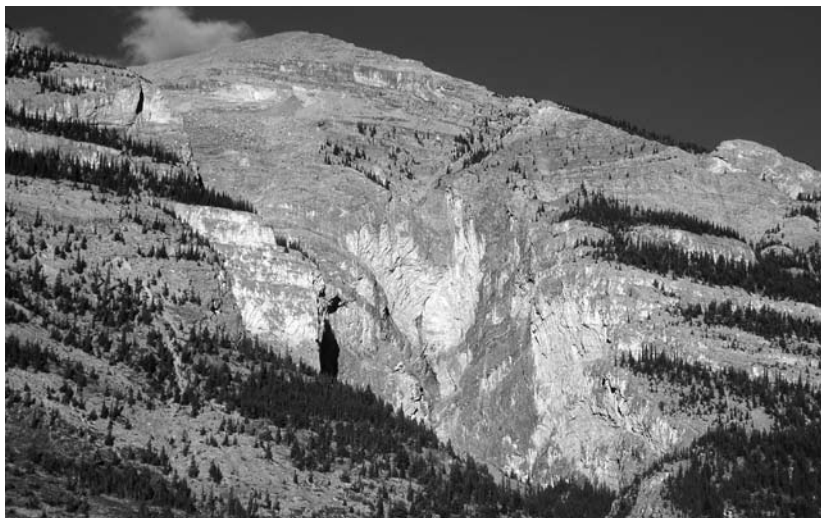
The Inner Sanctuary. Twisted Sister climbs the steep gray wall on the right side of the canyon.

This potential classic goes up a shallow buttress of grey rock near the left (upper) end of the right-