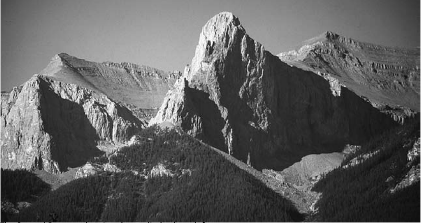
The Second Buttriss showing the unclimbed north face.

The Second Buttriss is characterized by a relatively sharp ridge leading to a thumb-like summit. It has a huge, unclimbed north face, only the upper part of which is visible from Canmore. Several attempts have been made to climb an obvious line on this face, which is best seen from Highway 1 near the Banff Park gate. It is similar in height to Ha Ling Peak and is certainly the highest unclimbed face in the area. All attempts to date can be described as "exploratory" and have ended only a few pitches up the wall. A route up the ridge was climbed in the early days of Bow Valley exploration but has probably not been repeated.