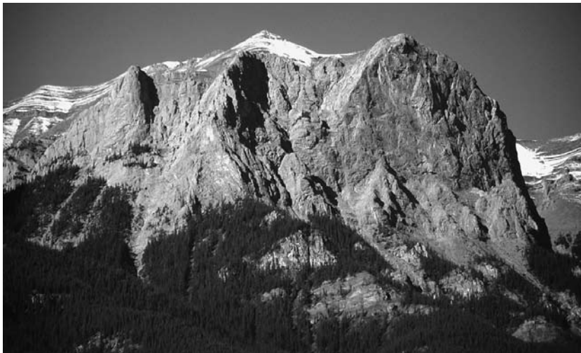
The Third Butress with Buddha Ridge to the left of the main face and the Aiguille de Rogan left again.

a small ledge below the main groove line close to the left edge of the butress.