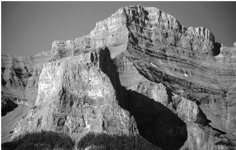
The Eighth Buttress at the park boundary.

There are no routes on either of these buttresses although there is some interesting ground. The Eighth is actually two buttresses, one behind the other, both of which are probably Palliser Formation limestone. The lower one has some interesting easier lines that may be loose and the upper one has an extremely steep, west-facing wall. A narrow cutline marking the Banff Park boundary just touches the west side of the lower buttress and helps confirm the buttress count. The Ninth Buttress is fairly broken on its east side but has a relatively small, steep face on the right. This is split by several possible lines but the rock is uncertain and it is a long walk up to the base.