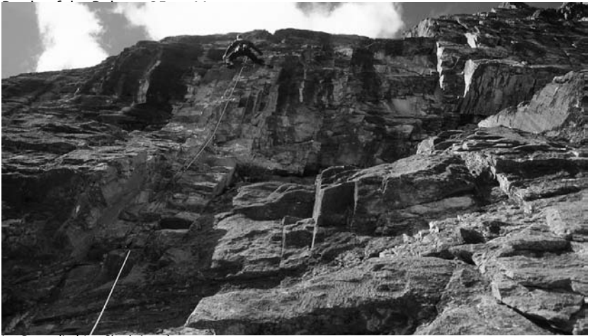
Ian Perry climbing Shark Attack.

This interesting climb begins about 5 m left of the small groove below a square-edged yellow pillar in a bulging, black-streaked wall. Climb easy ground up and left to a short right-facing slot and go up this to the base of the pillar. Layaway moves of the edges of the pillar lead to sustained climbing on the steep wall above.